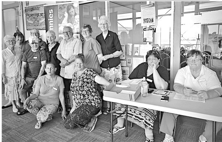
Above: Group of the workers who put the hampers together. Below: Food packages ready to go.